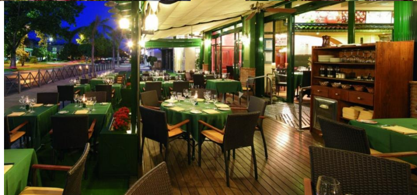
De Bruno Casa – Golden Mile