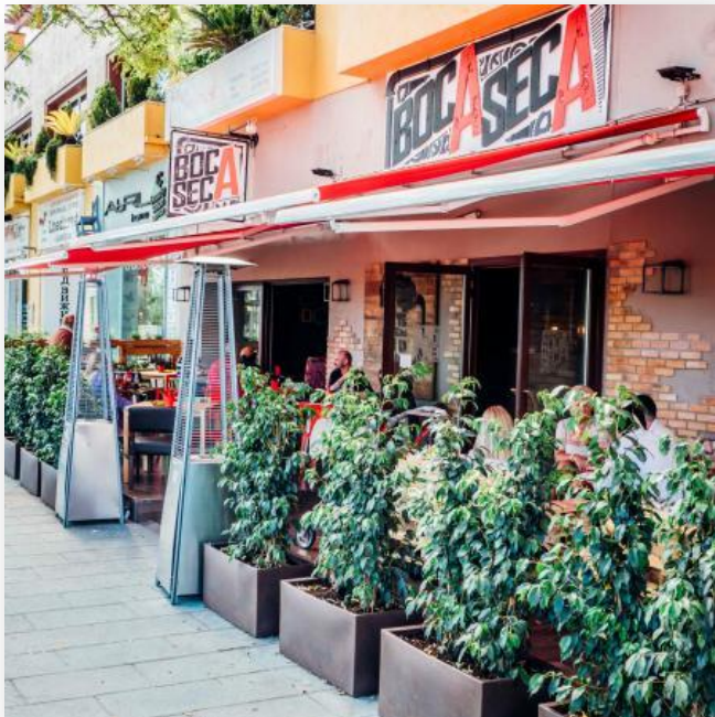
Marbella's Golden Mile

As Marbella and Nueva Andalucía residential areas become closer the Golden Mile will become the area's new High Street. In Marbella's new urban plan, the Golden Mile will see several new commercial buildings, hotels and a new larger exhibition complex.